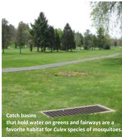
Catch basins that hold water on greens and fairways are a favorite habitat for Culex species of mosquitoes.