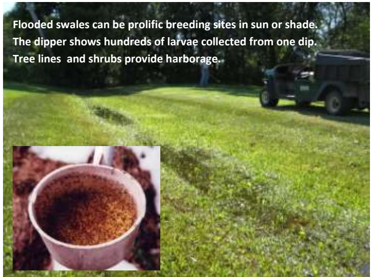
Flooded swales can be prolific breeding sites in sun or shade. The dipper shows hundreds of larvae collected from one dip. Tree lines and shrubs provide harborage.

The easiest way to reduce mosquitoes is through source reduction. Grading can eliminate standing water in grassy fields or around buildings and parking areas. Garbage cans should have holes so water can drain. Gutters on buildings should be free of debris. Swales should drain completely within 24 hours. Pay attention to the soil type. Heavy soils and slow-draining clay may hold water long enough for mosquitoes to complete their life cycle, especially during periods of frequent summer rains. Vernal woodland pools are an important source of insect diversity and provide habitat for other amphibians, reptiles, birds and animals. Rather than elimination, they should be treated specifically for mosquito breeding only when necessary.